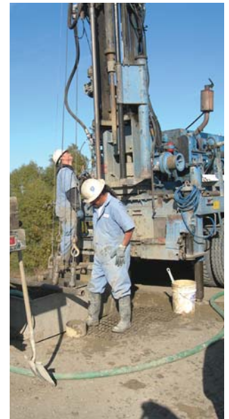
Levee Evaluation Project