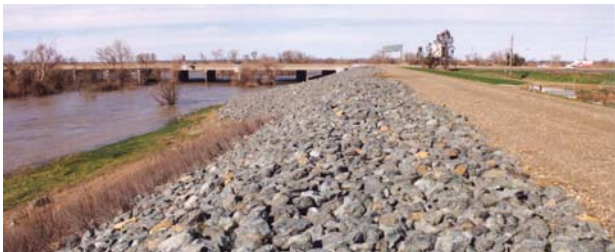
West Sacramento Project

The city successfully obtained state and federal funding to help with flood protection solutions but without the help of local funding, the level of flood protection would not be as high as it is now. With the West Sacramento Flood Control Agency reaching its authorized spending limit, the city and the Flood Control Agency will be bringing forth information in the coming months about how best to continue local funding.