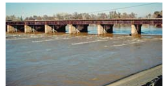
Storm Waters in Sacramento Bypass