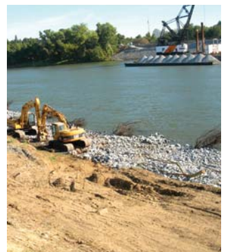
Erosion Repair near Linden Road